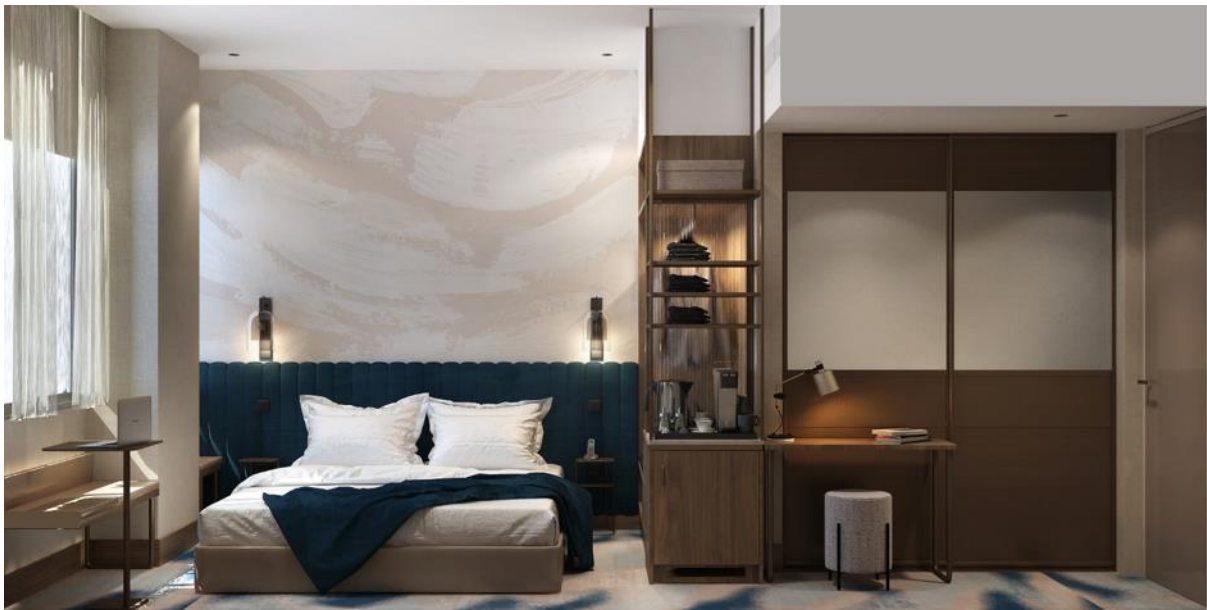
Photo caption: Room render for Aiden by Best Western @ Darling Harbour